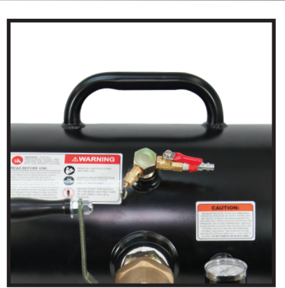
Ergonomically Designed Handle positioning to support full control of tank while seating tire/wheel.