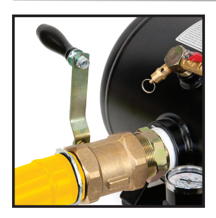
High-Force 2" Barrell designed for maximum air release