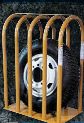
5-BAR CAGE PN 36005