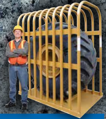
T112 12-BAR CAGE PN 36012

10-bar construction fits up to 29.5R25 L-3 Earthmover.