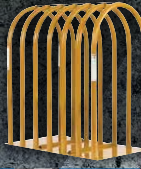
7-BAR CAGE PN 36008