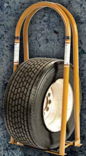
T109 MAGNUM™ 5-BAR CAGE PN 36009