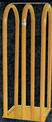
3-BAR CAGE PN 36006